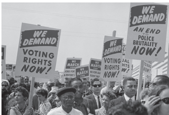
1963 March on Washington

Hospitality House urges you to exercise your right to vote. We analyze ballot measures that have an impact on our communities. Here are our endorsements: