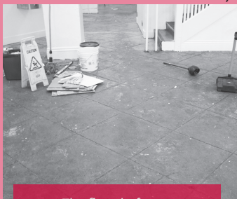
The floor before...

"Introducing the new furniture included this element of dignity where people weren't just slumped over in chairs, crammed next to each other,"