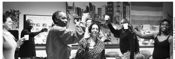
HOLD participants toast to their graduation

Turning trauma into triumph, together. Indeed. ##